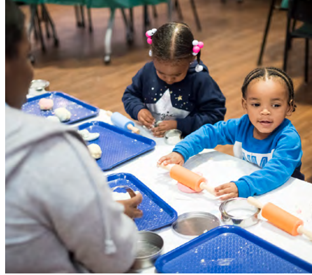
↑ Programs incorporated a range of self-directed activities to accommodate children of different ages, abilities, and attention spans.

In an art-based program a 5-year-old child recalled the narrative in a book that was part of the program: