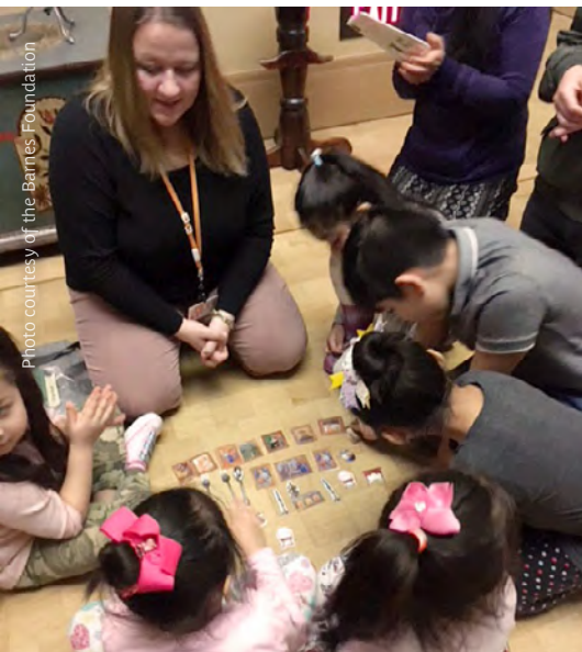
← A hands-on activity in the museum gallery gets children, caregivers, and program staff involved.

Efforts such as ILI are rethinking how museums consider public outreach by working closely with community-based organizations and focusing on the specific needs of particular audiences, so that they can tailor their resources and co-design educational experiences that are relevant, accessible and useful for target audiences. By supporting partnerships between ILOs and CBOs, ILI is encouraging informal learning professionals to move their practice towards collaborative, community-centered design that goes beyond traditional one-way educational outreach models. In this way, one of the more important and long-lasting impacts of ILI could be sustained changes in how museums see community in their work and how museums conceptualize their roles and responsibilities as part of a larger educational ecosystem. Through these partnerships, ILI is also encouraging community-based staff to see themselves as part of that same broader ecosystem who have the social capital, knowledge, and agency to co-design learning experiences that are accessible and welcoming to their communities.