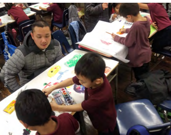
← ILI programming takes place in community centers throughout the city.