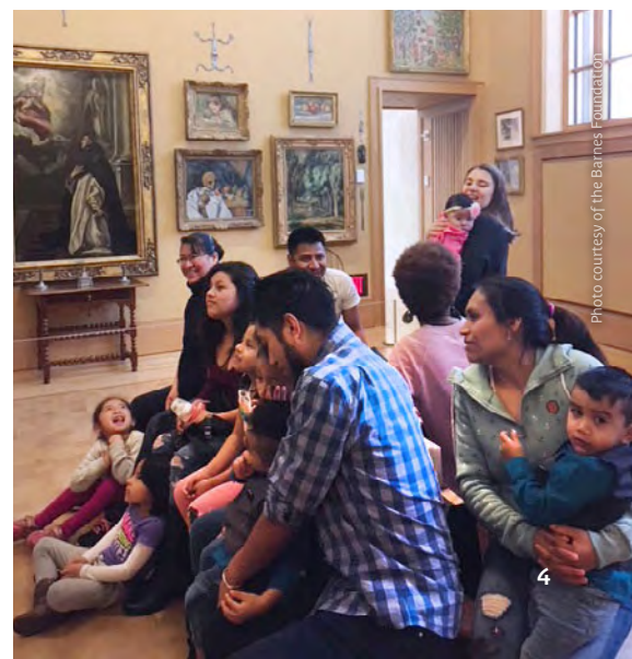
Top: Storytime at a science museum in Philadelphia; → Bottom: A family day at a fine arts museum.