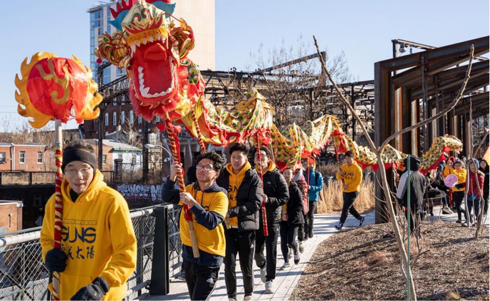
Lunar New Year celebration in the Rail Park.