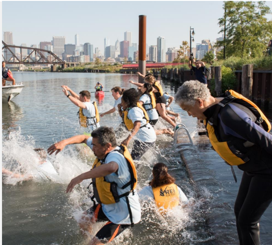
Pictured: Locals swim in the Chicago River, made possible by regulations and cleanup efforts.

Even as residents flock back to the region's waterways in the wake of major improvements from the 1972 U.S. Clean Water Act, regular sewage contamination translates into approximately 128 days each year when residents cannot play in many local waterways without putting their health at risk. 1